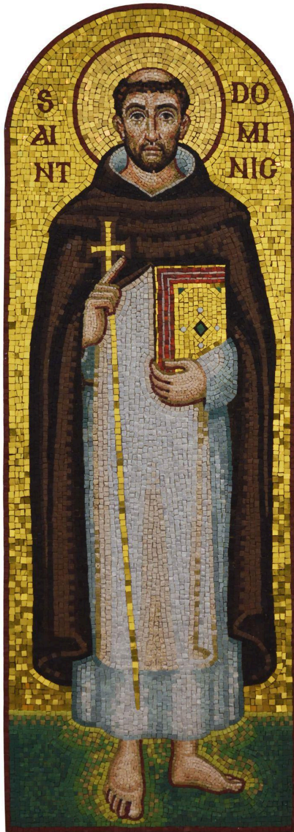
Mosaic of Saint Dominic for Chichester Cathedral