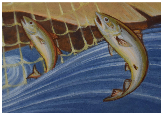
Panel icon of Saint Andrew for St Davids Cathedral